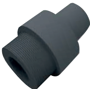
Graphite Block Back