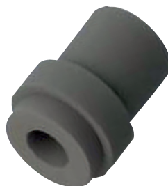
Graphite Block Front